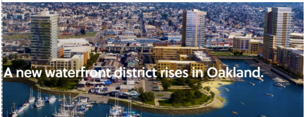
A new waterfront district rises in Oakland.

Part of the project is turning a 200,000 sf warehouse into a 20,000 sf retail space, restaurant and Marina Headquarters. It also includes new park land along the marina. The demo’s already begun and you can see it from the 88o freeway (major artery through the east bay).