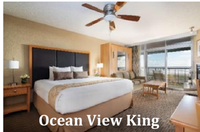
Ocean View King

All of our rooms come equipped with a coffee pot, mini fridge, microwave, pillow-top mattress, flat screen TV, DVD player, iron, ironing board, and AM/FM alarm clock.